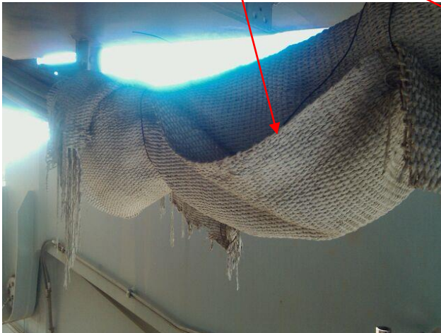
Blanket Containing Chrysotile Asbestos

It has been discovered that two sections of plant (reclaimers) which have been imported from China, have been transported along with a type of fire blanket, this blanket has been used to protect cabling within the plant from damage during transit. Tests carried out on the 20 th July have confirmed the presence of Chrysotile Asbestos in the material used to manufacture the blanket. The plant has since been isolated and the material is being removed by competent persons.